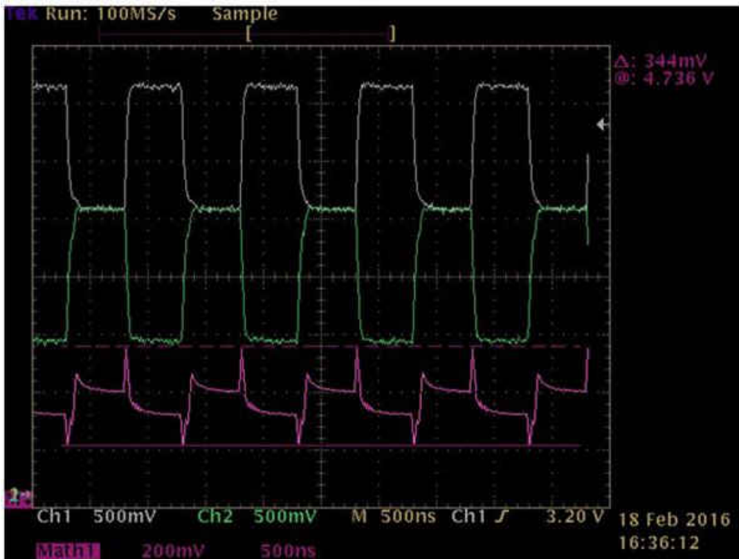
Figure 3. Example CAN Bus Signals with Standard Termination