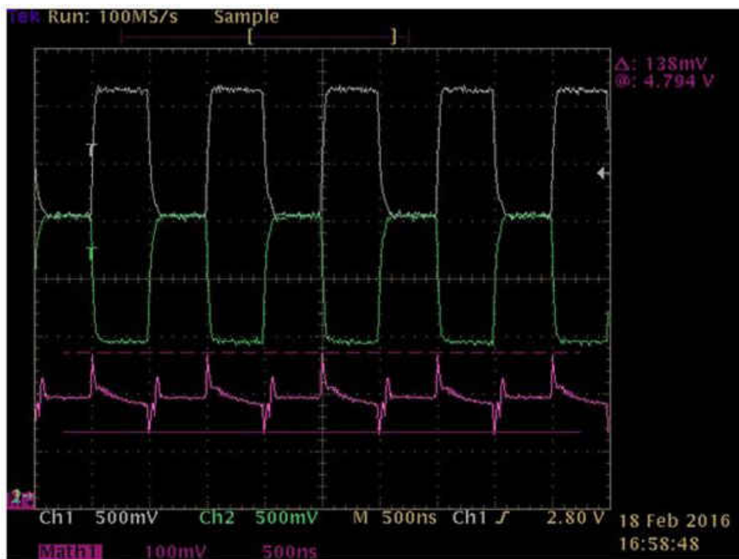
Figure 4. Example CAN Bus Signals with Single Standard Termination and Single Split Termination